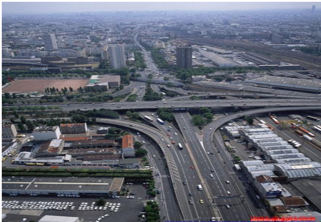
A picture of Saint-Denis, my town. In north of Paris.